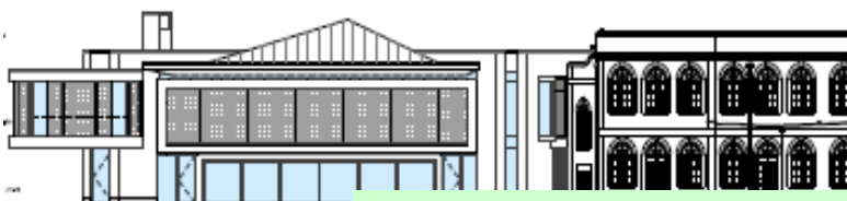
Rear Elevation (view from the school field)

All the changes should begin to create an even better physical environment for your children. There will obviously be some disruption during the works next year but we are working hard to plan strategically to keep this to a minimum. Please do come and see me if you'd like to discuss any aspect of the building work.