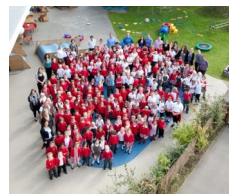
New whole school photo coming to the lobby soon!