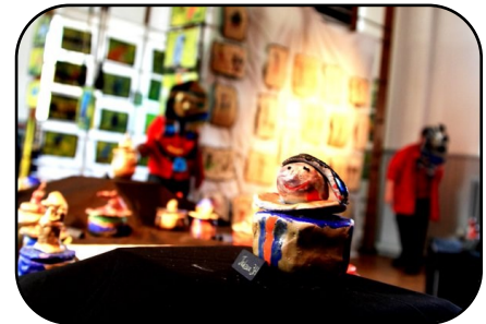
I was so impressed with the Year 3 and 4 Art Gallery this week. We love art at Lowther!