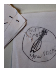
"You rock!" by Lizzie