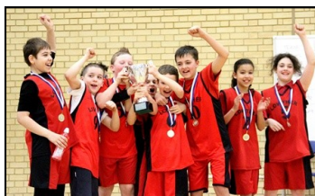
Lowther children having won a Richmond Knights Tournament last year

Richmond Knights Basketball Club run our Y3/4 basketball sessions and also organise many of the basketball tournaments that we've won on a number of occasions over the years. They work in a number of local primary schools and due to interest from dads (perhaps inspired by their son or daughter's exploits) have started up sociable weekly games for men of all abilities. I actually go myself and it's really excellent fun. The sessions run every Tuesday from 7.45pm—9.15pm at Christ's Secondary school, The sessions cost £6 and you simply need to turn up and play (and pay) . Anyone interested in giving it a try do get in touch with me and I'll let you know more. I'd highly recommend it as a sociable way of keeping fit and having some fun!