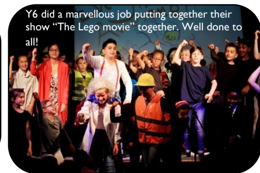
Y6 did a marvellous job putting together their show "The Lego movie" together. Well done to all!