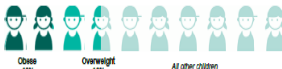
The proportion of Year 6 children who were overweight or obese (34.4%) is statistically similar compared to other schools across England (34%). 25% of Year 6 children were overweight or obese in Richmond upon Thames local authority.

Parentmail is the easiest and quickest way for you to stay in touch with important events at school. Most families have signed up but if you haven't please do so. You can pick up an application form from the school office. Twitter is another super way to see pictures and hear all the news from school. You don't need to sign up to Twitter, you can access the feed via the latest news section on the school website