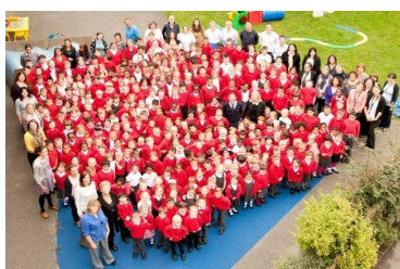
Look out for a new whole school photo soon!

Senior leaders at the school and governors are busy putting the finishing touches to our school improvement plan for 2014-15. As you may remember we hosted a night for parents at the end of last term to begin sharing these plans. We'll make sure the full details of our plans to drive further improvement at Lowther are on the school website in the coming weeks.