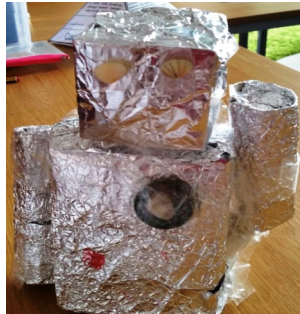
This robot will write down what we're thinking (and then it will self-destruct!)

Welcome back! We hope you all had a lovely rest over the Summer holidays and are ready to start the new school year. Your children began the new school year agreeing class rules, deciding areas of responsibility (monitors) and working on a special project, inventing a brand new school product. After designing their product, measuring dimensions, deciding costings and putting together a powerpoint, the children presented their ideas to their class on Friday. We were left pondering how we have ever survived without an extended, mechanical glove which gets us drinks of water from our seats or mathematical cubes which turn into tables in the classroom and Frisbees in the playground! This week, we get stuck into the Year 5 curriculum.